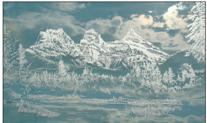
Three Sisters Mountain Peaks Laser Etch

This piece was originally done for someone who had a vacation property at Canmore, but was installing a deck at their home near Edmonton. That way, they could sit on their deck in the morning and have the picture of the Three Sisters Mountain Peaks to enjoy with their coffee.