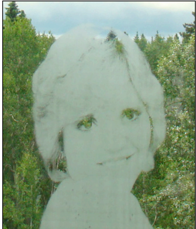
Three Sisters Mountain Peaks Laser Etch

Whether your tastes are abstract artwork, mountain scenery from your favourite vacation spot, or family photos, we can etch it with incredible resolution and clarity.