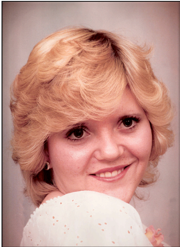
Three Sisters Mountain Peaks Original

The second sample picture shown originates from a 30 year old nicotine covered picture, scanned and cleaned up and etched into a 55 inch clear tempered panel.